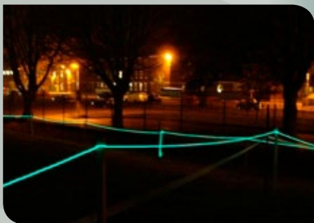
Waysafe being used to illuminate pathways