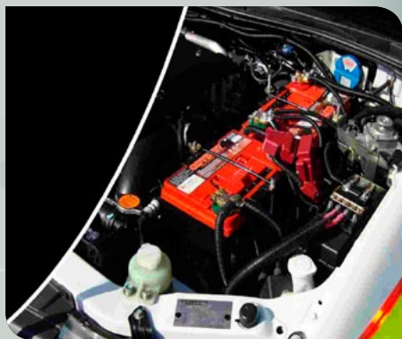
The Triton Batteries