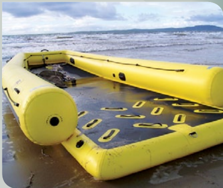
RS10 Rescue Sled

KEEPING YOU UP TO DATE WITH ALL THINGS EMERGENCY RESPONSE.