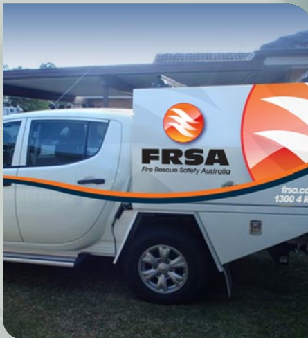
The new FRSA Triton