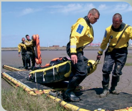
Airtrack rescue path