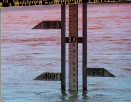
Reaching new heights